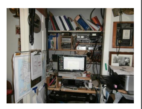
W5FWR closet shack.